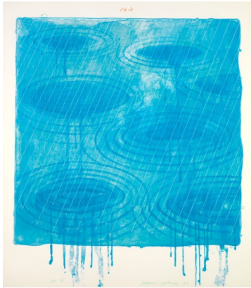
Rain from "The Weather Series", 1973