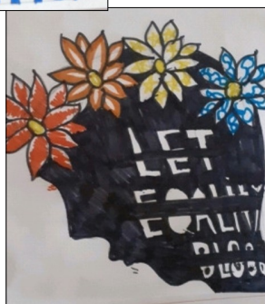
'Let Equality Bloom'