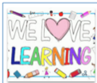
RICH & EXCITING CURRICULUM