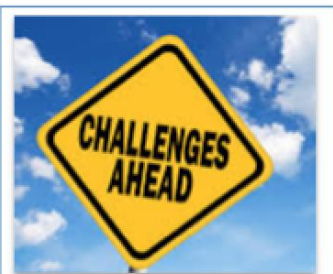
LEVEL OF CHALLENGE