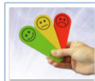
ASSESSMENT WITHOUT LEVELS